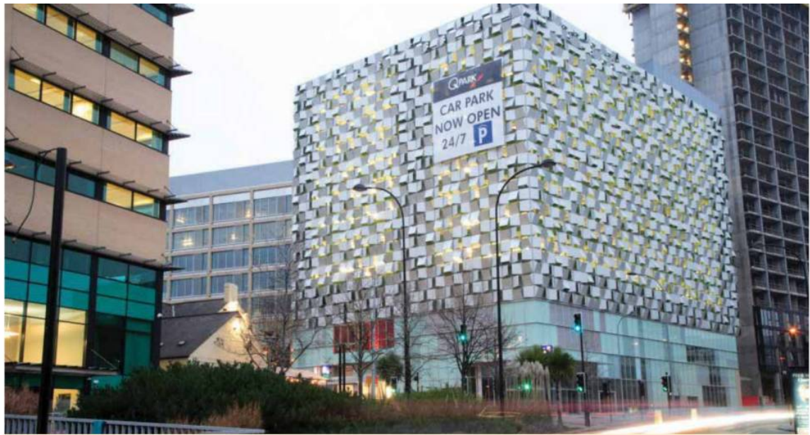
World's Quirkiest Car Park in Sheffield, UK